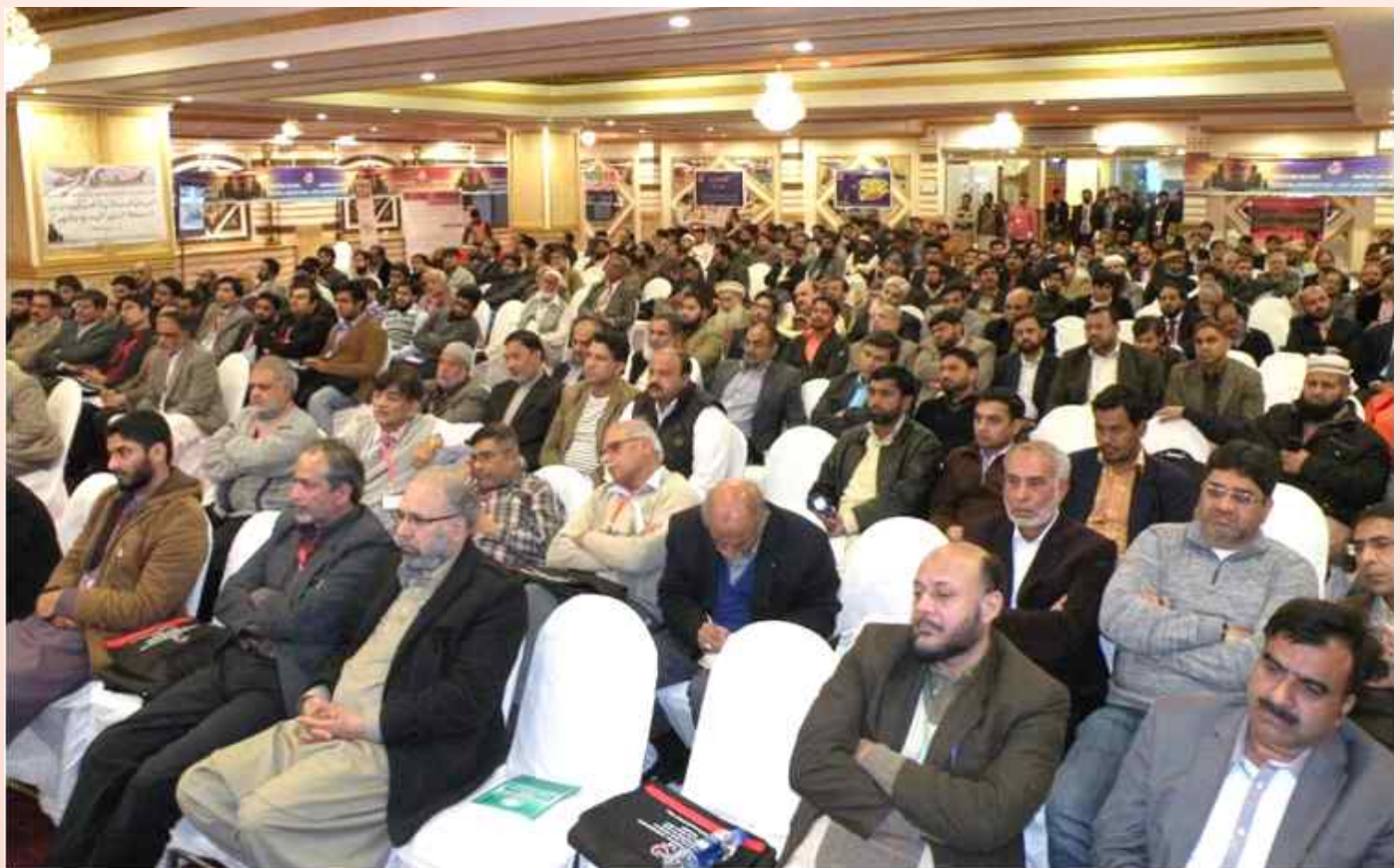
A view of audience of PIMA Punjab convention 2015.